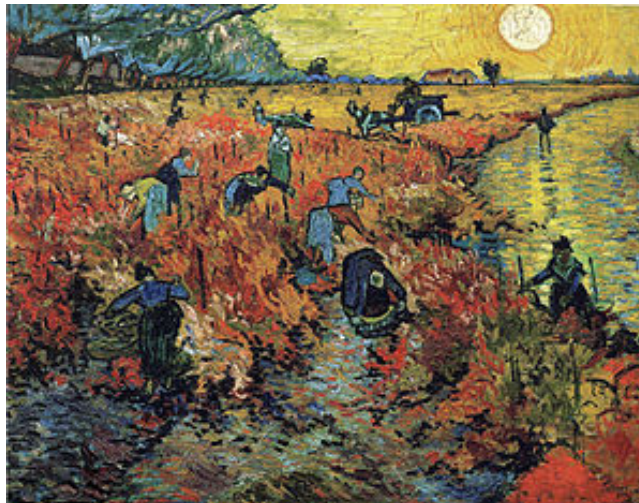
The Red Vineyards near Arles by Vincent van Gogh

https://www.ministrymatters.com/all/entry/1112/worship-elements-may-31-2020