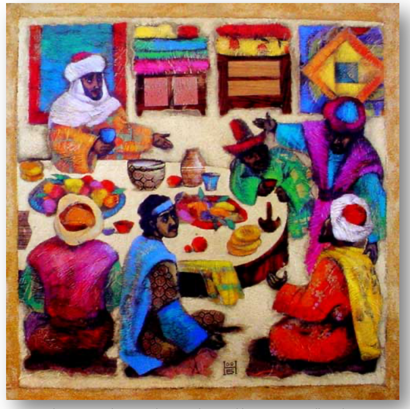
The Lowest Places at the Feast by Kazakhstan Artist Nelly Bube